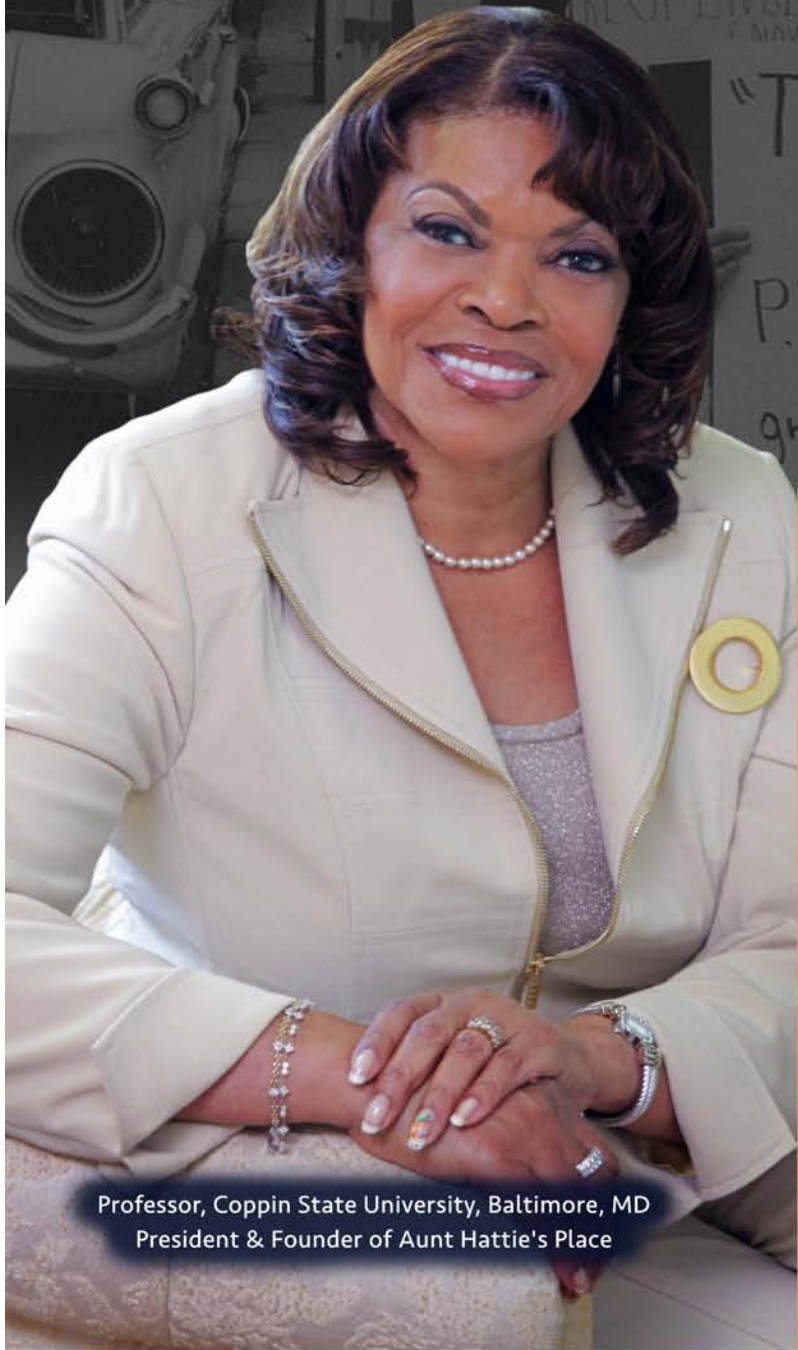
Professor, Coppin State University, Baltimore, MD President & Founder of Aunt Hattie's Place

An Inspirational Memoir of Lessons Learned Through Faith, Family and Favor